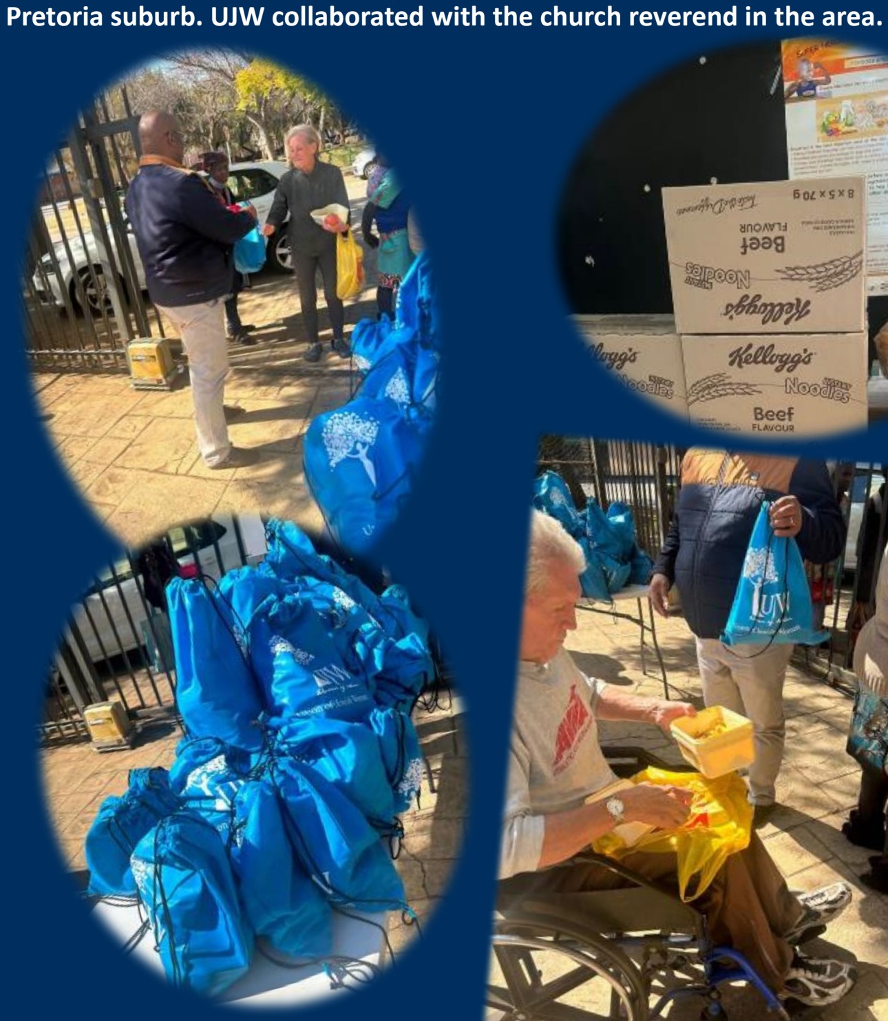
Food is packed in beautifully designed UJW bags.

This small branch does the most incredible work by assisting those in need. Bags of food were donated to volunteers who helped clean the streets in a